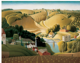
Stone City, Iowa 1909 Great Wood, 1891-1942

Citizens United for Responsible Land Use